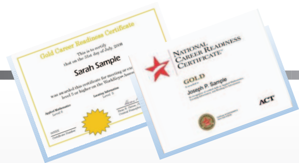
Career Readiness Certificates Issued (DECEMBER 2010)

Responding to a CPWDC challenge to issue 700 CRCs between February and July 2010, the Central PA CareerLink® offices issued 635 certificates, meeting 95% of that goal. The Lycoming, Union/Snyder and Mifflin County CareerLink® staff exceeded their site goals. A new regional goal has been set for 800 certificates awarded between August and December 2010. ●