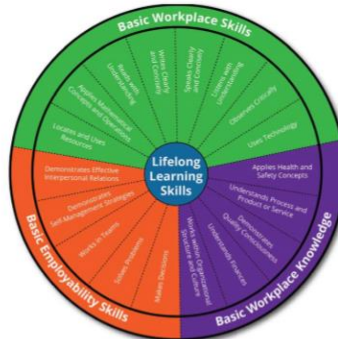
Foundation Skills Wheel Self-Appraisal Competency Lists